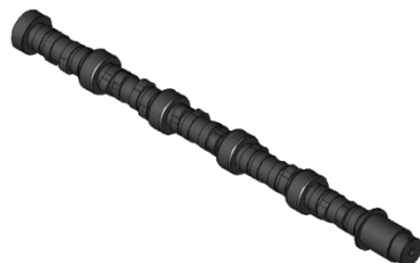
( Work Sample )

Camshaft journal milling machine with 2 upper turrets. With a face driver and live center, all journaling is possible. The two upper turrets allow the operator to get closer to the workpiece, allowing for easy loading and unloading of the workpiece and contributing to increased productivity.